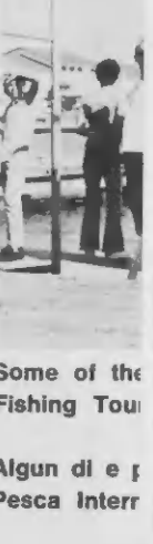
Some of the Fishing Tou...